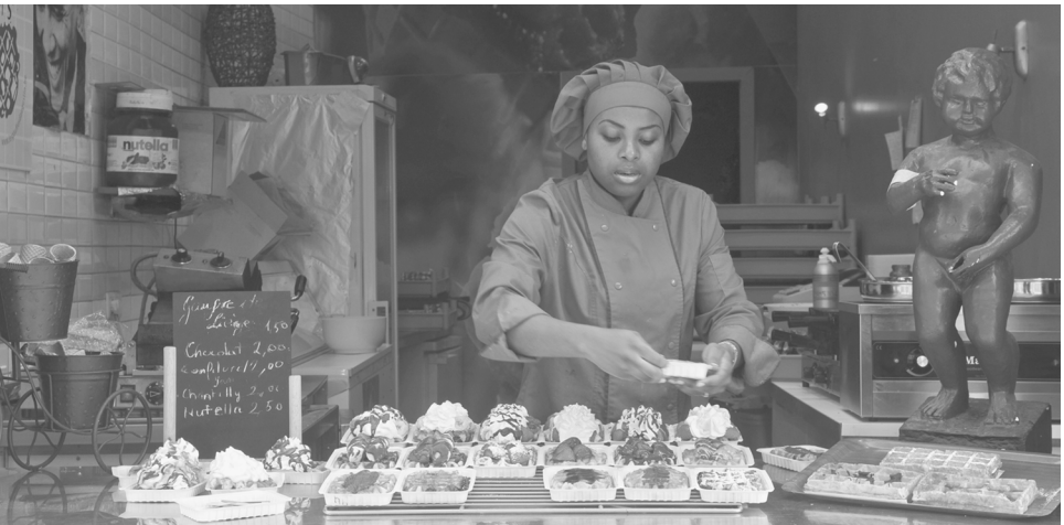
Waffle seller in a typical waffle stand in Brussels, Belgium.

Brusselse Wafels should not be confused with their sweeter variant: Luikse Wafels , or waffles from Liege, a town in the Southern part of Belgium. According to legend—though written proof is not existent—these emerged already in the 18th century when the prince of Liege asked his chef to prepare him a sweet dish with sugar. Little pieces of sugar were added to the waffle dough, and the prince loved them.